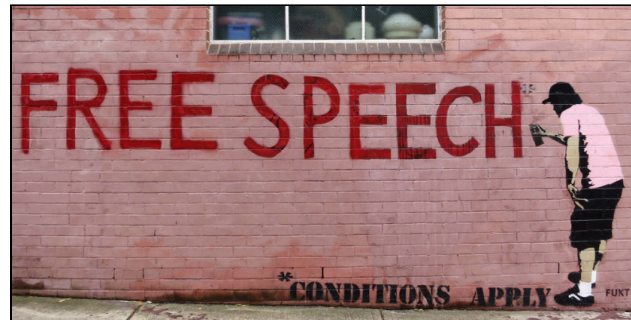
"Newtown Mural"

Censorship is an extremely controversial issue, and each country usually has its own reasons for passing these laws. However, there are a few core reasons why a government would want to restrict communication.