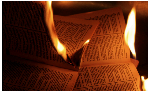
"Burning Books Page1"

I want you to know, too, that my publisher and I have done absolutely nothing to exploit the disgusting news from Drake. We are not clapping each other on the back, crowing about all the books we will sell because of the news. We have declined to go on television, have written no fiery letters to editorial pages, have granted no lengthy interviews. We are angered and sickened and saddened. And no copies of this letter have been sent to anybody else. You now hold the only copy in your hands. It is a strictly private letter from me to the people of Drake, who have done so much to damage my reputation in the eyes of their children and then in the eyes of the world. Do you have the courage and ordinary decency to show this letter to the people, or will it, too, be consigned 1 to the fires of your furnace?